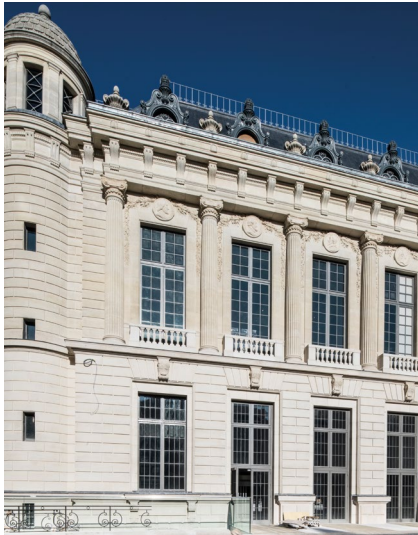
Entrance in Rue Vivienne

Audience outreach tools will enable the public to engage with the collections on display and to see the bigger historical picture behind each piece. A programme of temporary exhibitions in the Mansart Gallery will round off this cultural offering, starting with Molière, le jeu du vrai et du faux (Molière, a game of true and false) , which will run from 27 September 2022 to 15 January 2023.