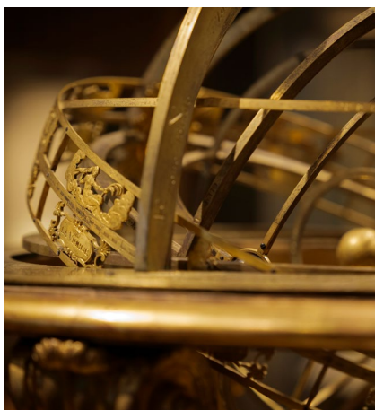
BnF museum

and art history as well as comics and digital art. Much more than just a reading room, the Oval Room will thus become an enlightening visitor attraction, open to wide-ranging experiences thanks to innovative features including the possibility of virtually trying on costumes, for an enthralling journey through the BnF's collections.