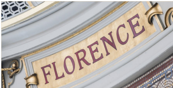
Oval Room

Preserving its inestimable collections under the very best conditions, providing researchers with an inspiring working environment and giving everyone the opportunity to enjoy this common good: such was the overarching ambition of the site's renovation.