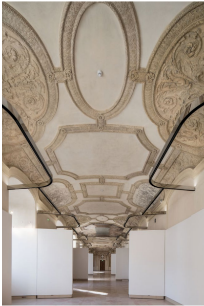
Mansart Gallery