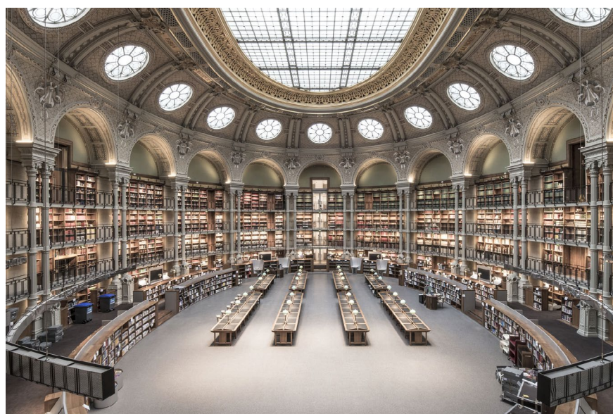
Oval Room