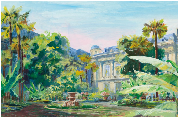
Vivienne Garden

This journey through time charts the history of one of the world's most comprehensive libraries, where change has been an enduring hallmark, and which today magnificently juxtaposes its historical dimension and contemporary relevance.